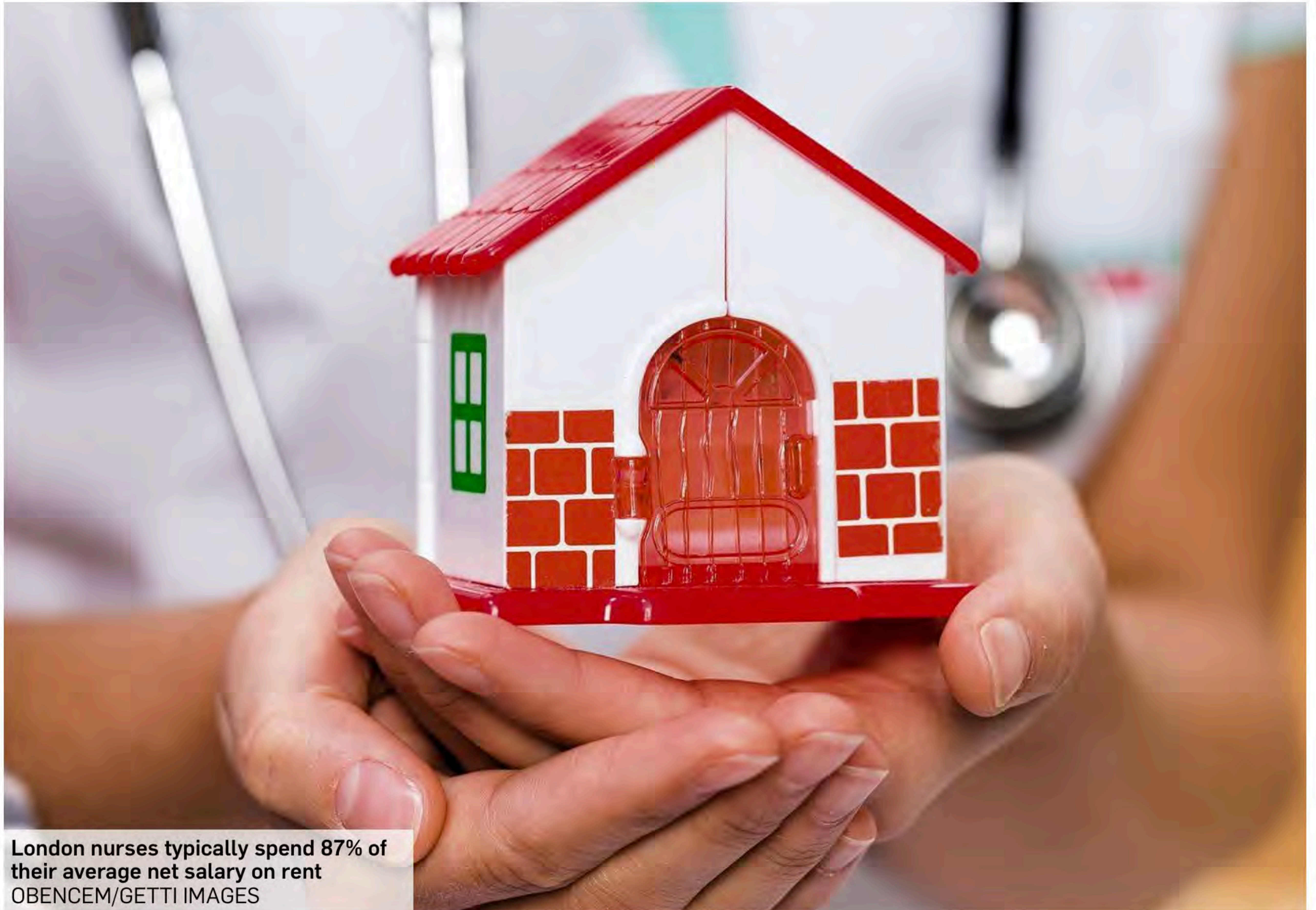
London nurses typically spend 87% of their average net salary on rent

Our homes are in the spotlight as never before — here are some of the things we've been loving and loathing