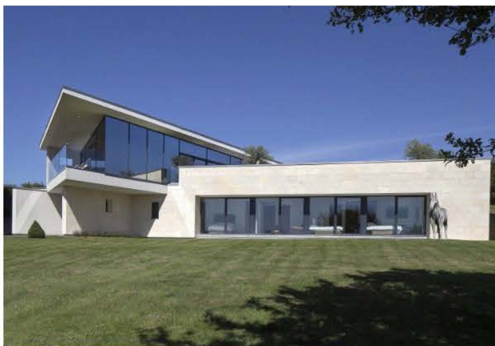
The Glasshouse near Aylesbury, Buckinghamshire, has a high-tech pump, £3.95million through Savills

Heat pumps are included in the government's new Green Homes Grant scheme, which allows owners to claim two thirds of the cost of energy-efficient measures up to £5,000 (a maximum of £10,000 is available for those on low incomes and in receipt of certain benefits). Homeowners make up any shortfall in costs