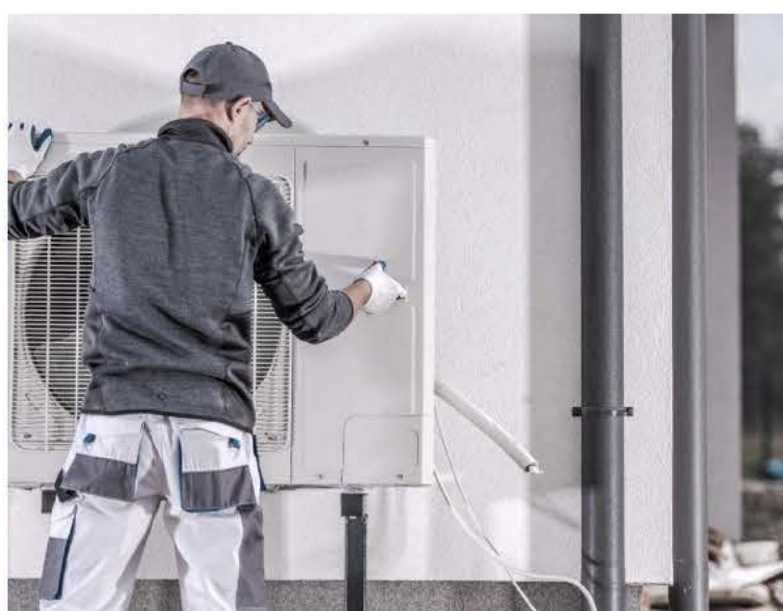
Having a heat pump installed can help you spend less on your energy bills

How quickly you make savings with a heat pump depends on the energy source you already use. The most dramatic results would be achieved by ditching a solid fuel or electric-powered system, not gas. If you have a combination boiler you'll need a