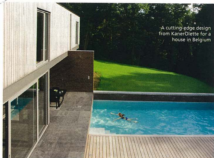
A cutting-edge design from KanerOlette for a house in Belgium

Using an architect may not be as expensive as you think, either. Some offer a free initial consultation; others charge, but only a modest amount – usually around £50. After that, in the early stages an hourly rate for the work is usually set. But a cap can be put on this and once